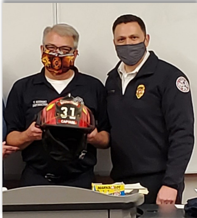
Promoted to rank of Captain (during Covid) on 1-5-2021