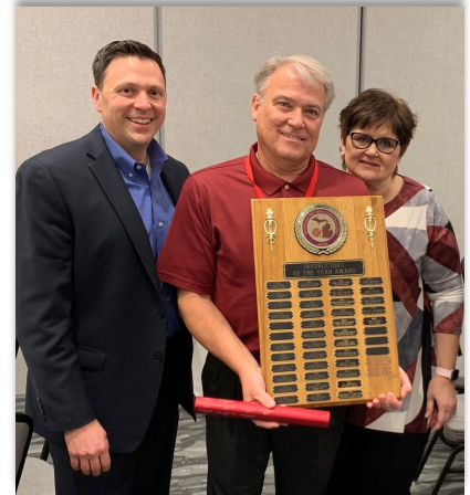
Received the 2019 MFSIA Fire Instructor of the Year Award