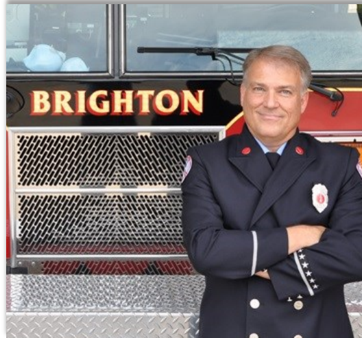
Proudly served as Lead Fire Instructor at Howell HS Fire Academy, 2012-2023